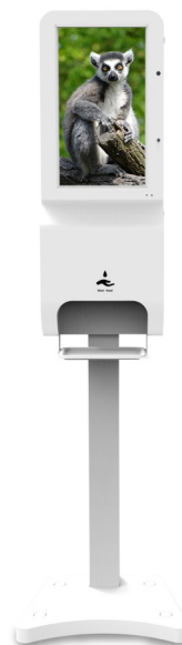
Floor Stand Option

Users may be advised to not enter the premises if an abnormal temperature is found.